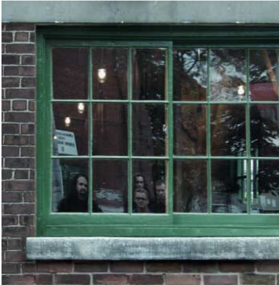
BACK COVER / Page 20