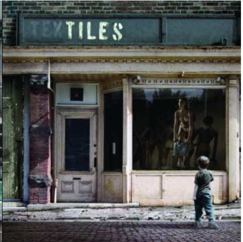
FRONT COVER / Page 1